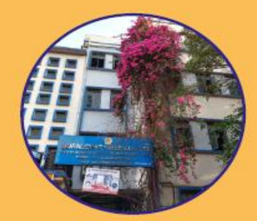
Muralidhar Girls' College, Kolkata